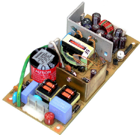
Size: 5.00 x 2.36 x 1.00"