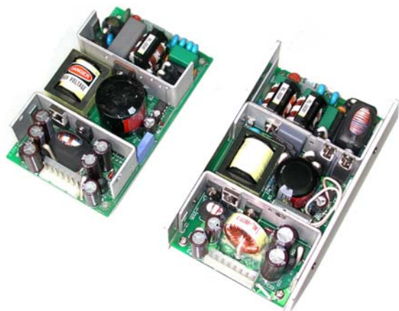
Open Frame = 5.00 x 3.00 x 1.10" / U-Frame = 5.50 x 3.29 x 1.57"