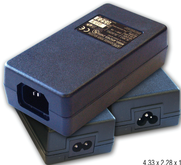
4.33 x 2.28 x 1.27"