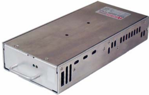
10.51 x 4.99 x 2.05"